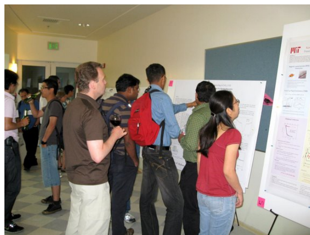
Poster session at the summer school.