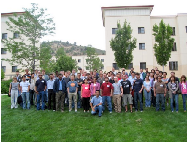
Attendees of the first Magnetics Society summer school.

The summer school was organized by the Education Committee and was supported by the Magnetics Society. All students were provided with free room and board and with funds to cover most of their travel expenses. The summer school was a great success due to the efforts of a large number of people. These included the program committee, selection committee, treasurer, lecturers, faculty and staff at Colorado Springs, and, of course, the students who attended. Tentative plans are to have the 2009 summer school at Nanjing University. ❖